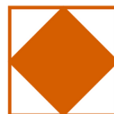
Ability & Neurodiversity