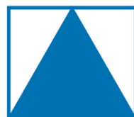
Women in Geoscience