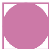
Mental Health Awareness